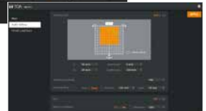
Coverage Area Setting