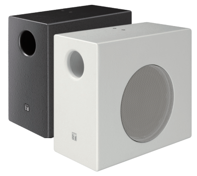
FB-08BT/WT 8-inch subwoofer