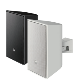
F-05BT/WT 5-inch 2-way speaker