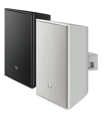
F-08BT/WT 8-inch 2-way speaker